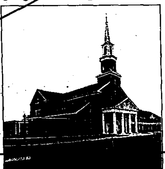
This is the exterior of the new Frederick Seventh-day Adventist Church at 8437 Jefferson Pike.

The Frederick Adventist School and gymnasium were spared and served the congregation as a location for both services and classes while the new